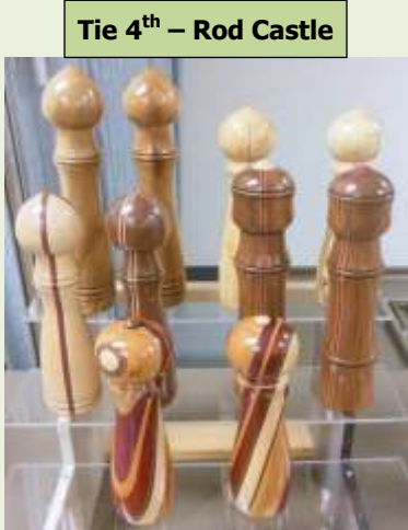
Tie 4 th – Rod Castle