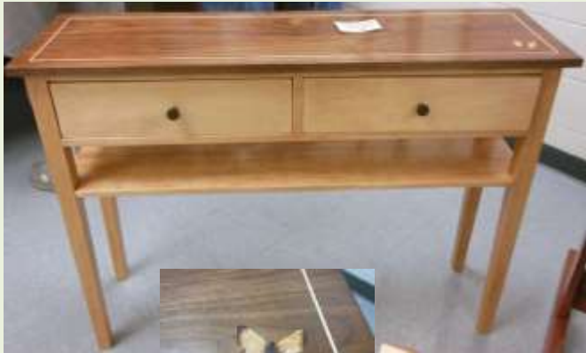
Close-up of Jim's Inlay