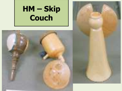
HM – Skip Couch