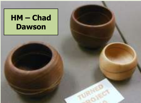
HM – Chad Dawson