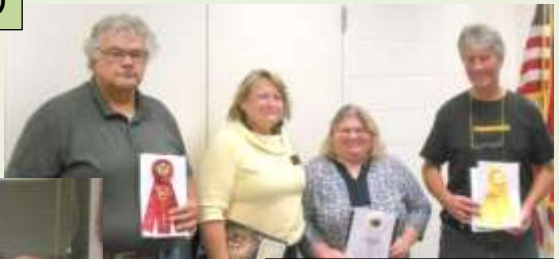
Participants in Carved & Sculpted