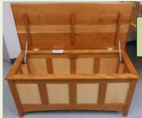
← Don's Chest Open