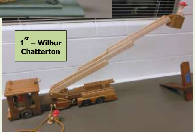
1 st – Wilbur Chatterton