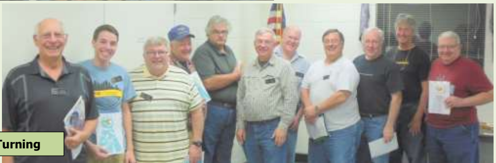
Participants in Turning