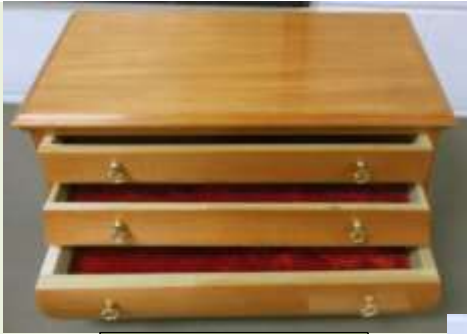
1 st – Terry Dote