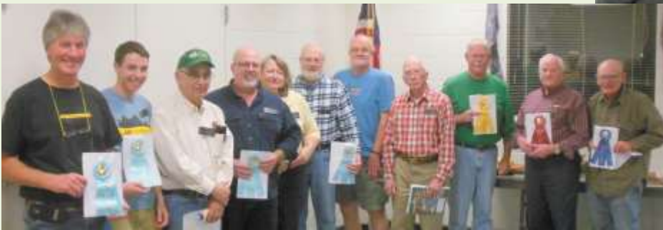
Participants in Toys