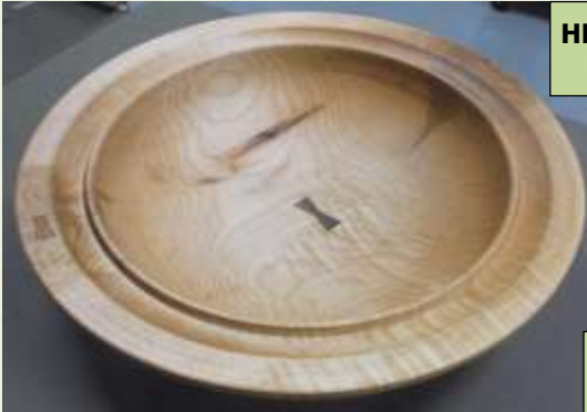
HM – Charlie LaPrease