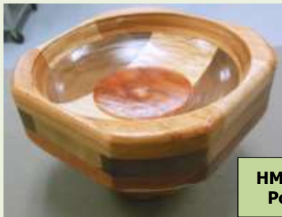
HM – Dick Powers