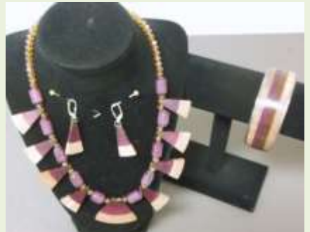
2 nd – Jim Yonkers