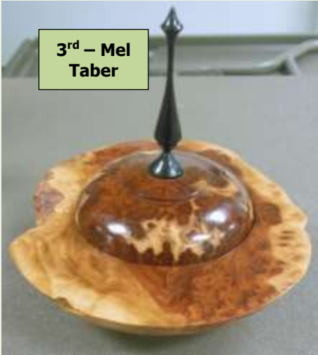
3 rd – Mel Taber