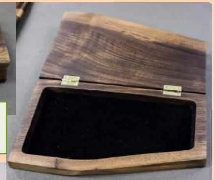
Hinged What-Not Box Walnut Mineral Oil & Wax Finish