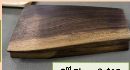
3 rd Place & $15 Jim Ruddock